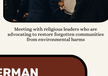
Meeting with religious leaders who are advocating to restore forgotten communities from environmental harms

THIS YEAR, SENATOR FETTERMAN INTRODUCED 19 PIECES OF LEGISLATION AND WORKED ACROSS THE AISLE TO CO- SPONSOR 249 BILLS.