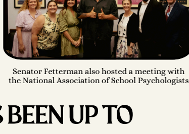
Senator Fetterman also hosted a meeting with the National Association of School Psychologists