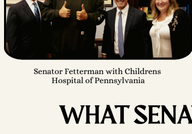
Senator Fetterman with Childrens Hospital of Pennsylvania