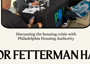
Discussing the housing crisis with Philadelphia Housing Authority