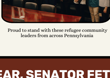
Proud to stand with these refugee community leaders from across Pennsylvania