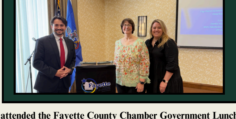
Staff attended the Fayette County Chamber Government Luncheon to hear from local leaders and businesses.